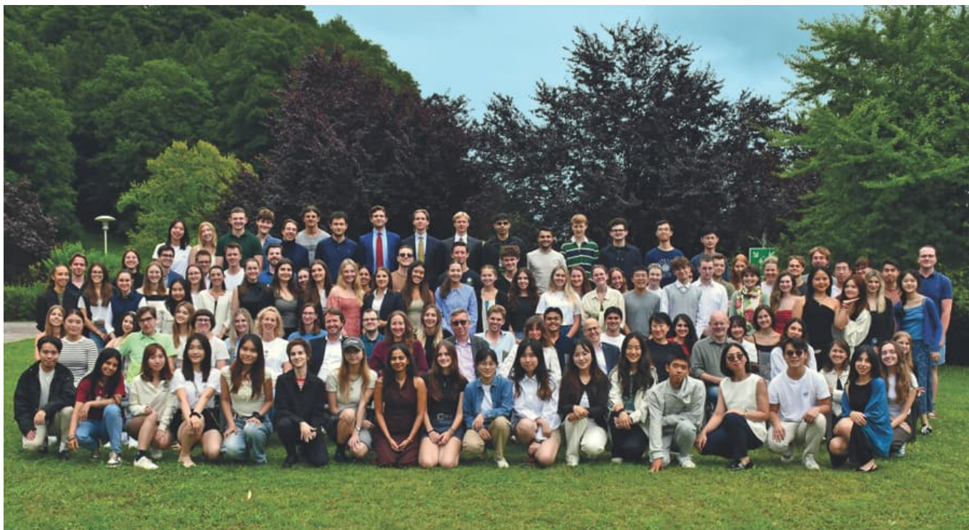
Summer school participants 2025